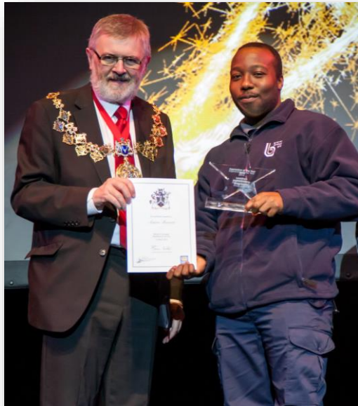
Apprentice of the Year 2014, Lewisham