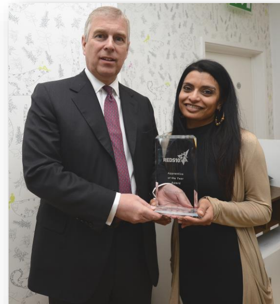
Apprentice of the Year 2013 & The Worshipful Company of Plumbers Award, Feb 2014